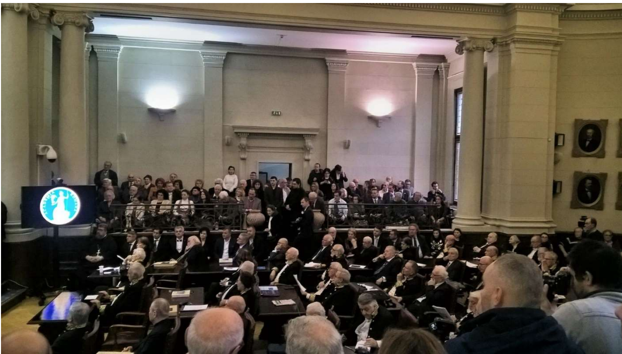
Aula Magna of the Romanian Academy on 12 December 2019