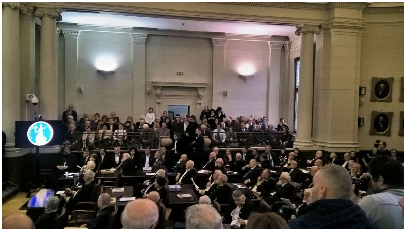
Aula Magna of the Romanian Academy on 12 December 2019